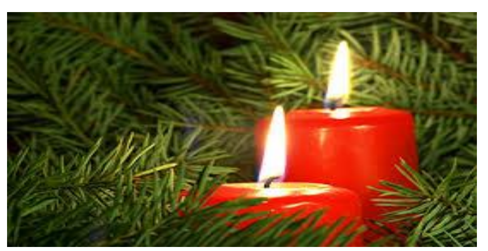
SECOND CANDLE OF ADVENT