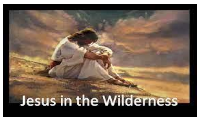
LUKE 4: 1 - 13

4 Jesus, full of the Holy Spirit, left the Jordan and was led by the Spirit into the wilderness, <sup>2</sup> where for forty days he was tempted by the devil. He ate nothing during those days, and at the end of them he was hungry.