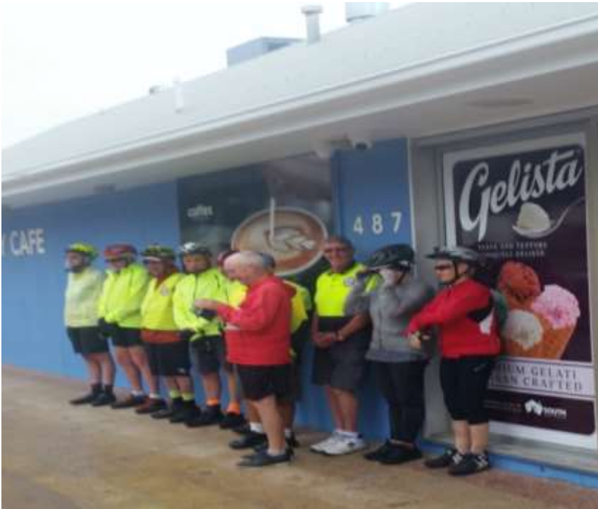
Waiting to be told to leave.